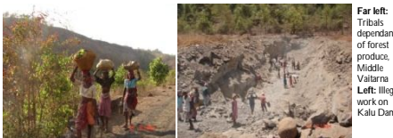
Far left: Tribals dependent on forest produce, Middle Vaitarna. Left: Illegal work on Kalu Dam

At the same time, there is a potential for managing urban water demand which can be spear-headed through participation of urban and rural population in management of their basin.