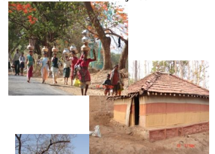
Above and left: Submergence area of Pinjal-Gargai Dams. Top: Tribals in Vaitarna basin look for water even as their basin has three dams for supplying water for Mumbai

•Some rivers with high conservation and community value flowing through urban areas should be protected as Free Flowing Rivers .