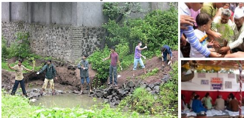
Above :Activities of Jal Biradari Pune.